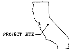
FIGURE 1 VICINITY AND SITE MAP MERCED AUXILIARY AIRPORT MARIPOSA COUNTY, CALIFORNIA Project No. 6223-011 Site No. J09CA087100